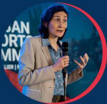
Madame Amélie OUDÉA-CASTÉRA

Ministre des Sports et des Jeux olympiques et paralympiques