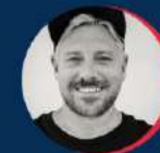
CJ WELLSMORE Three-time Rollerblade World Champion