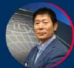
Morinari WATANABE President FIG