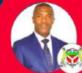
Augustin BALA Mayor Yaoundé 5 Cameroon

Montpellier City Hall Session in French / Translation in English