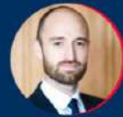
Samuel DUCROQUET Ambassador for Sport French Ministry of Foreign Affairs