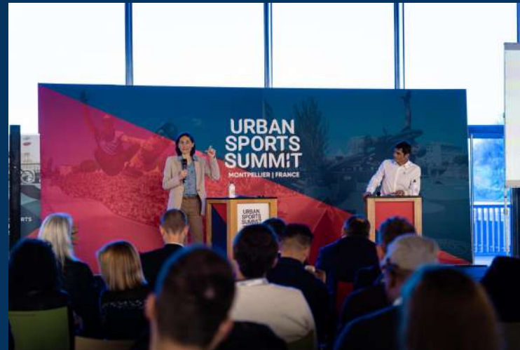
Official opening of Day 2 of the USS

The morning sessions focused on the use of sport as a tool for territorial development , and the place of urban sports in Africa