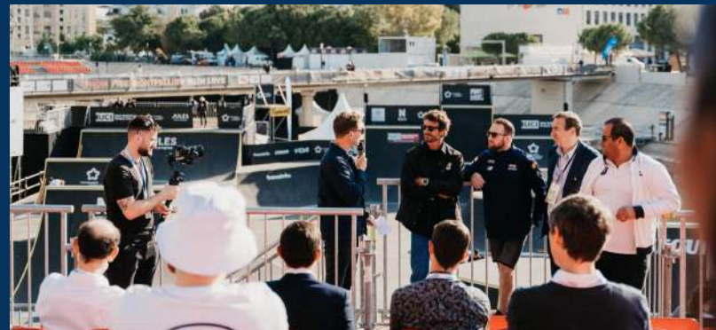
Official opening of Day 1 on the BMX Freestyle Park

Morning session set the scope of urban sports: More than sports, urban sports are a culture . Youth needs public spaces to train and practice all together.