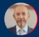
Fabio MONACO Consulate General of Italy Embassy of Italy