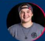
Hannah ROBERTS Triple championne du monde de BMX freestyle USA Cycling