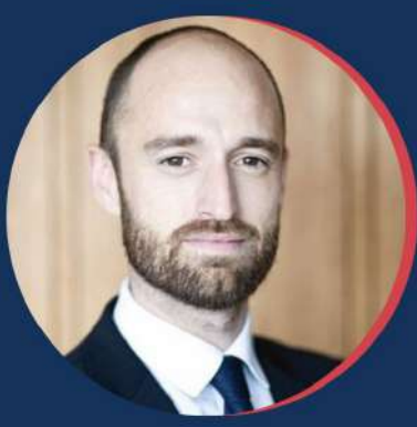
Samuel DUCROQUET Ambassador for Sport French Ministry of Foreign Affairs