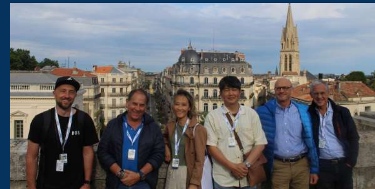
Montpellier City Tour