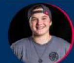
Hannah ROBERTS Triple championne du monde de BMX freestyle USA Cycling