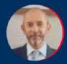
Fabio MONACO Consulate General of Italy Embassy of Italy