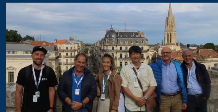
Montpellier City Tour