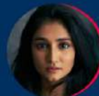
Vinati MAKIJANY Writer, Producer - Skater Girl movie - Mao Productions