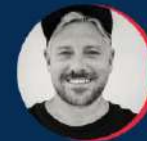
CJ WELLSMORE Three-time Rollerblade World Champion